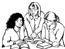
Women's Bible Study

Please remember these families in your prayers.